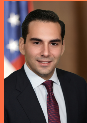
ARRC CHARIMAN JARETT GANDOLFO

As Assembly Republican Leader, he works closely with Assembly Republican Members to put forward statewide public policies that reflect the legislative priorities of the Conference.